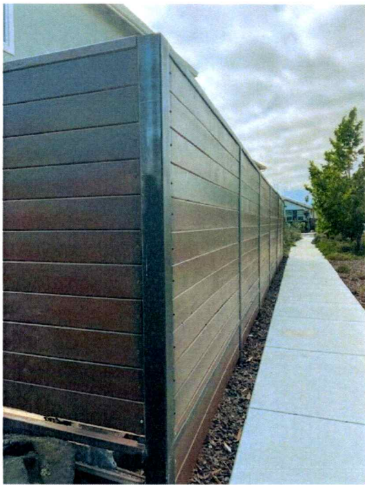
Fence extended closer to sidewalk