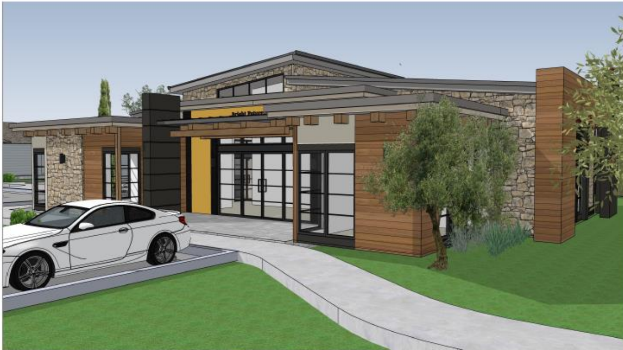
Figure 2 – Front of the Administration Building

Renderings of the two new buildings can be found on page A4.8 of the project plans included as Exhibit A of Attachment 2.